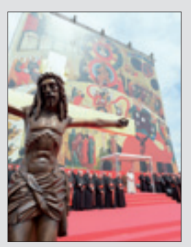
To Neocatechumenal Way On mission as disciples