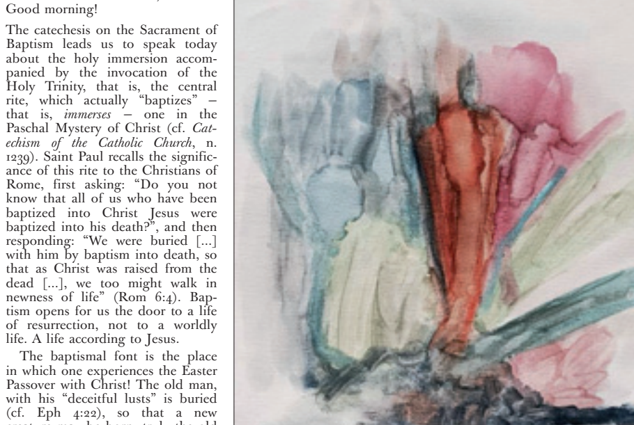
C Armenta, "Born again"

sacrament of Christian initiation, the Pontiff spoke about the central rite of "the holy immersion" accompanied by the invocation of the Holy Trinity. The following is a translation of the Pontiff's reflection, which he shared in Italian.